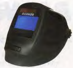
RDX60 Black RAD64005215