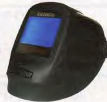
RDX81 Black RAD64005225