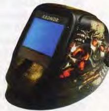
RDX81 Incinerator RAD64005227