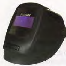
RD48 Black RAD64005205