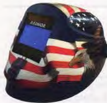
RDX60 Allegiance RAD64005216