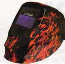
RD48 Blaze II RAD64005206