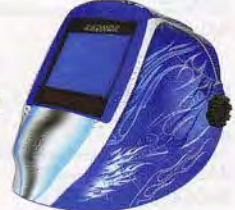
RDX81 Blue Fusion RAD64005226