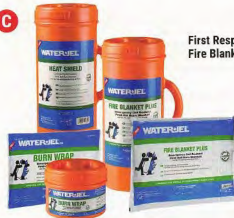
First Responder Fire Blankets