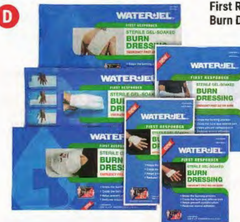
First Responder Burn Dressings